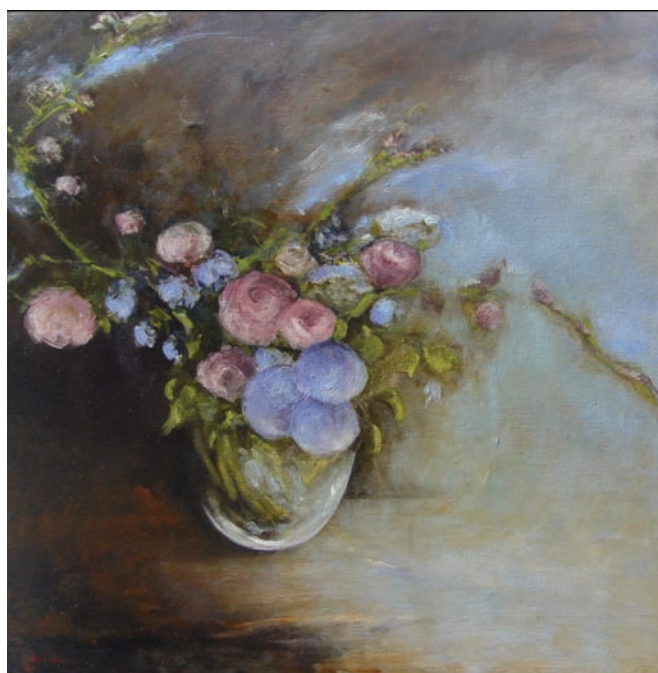
Bee, Oil on canvas, 100 x 100 cm