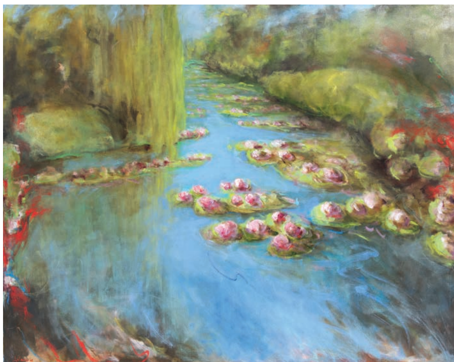
Les Nymphéas n°6, Oil on canvas, 125 x 160 cm