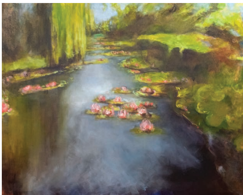
Les Nymphéas n°4, Oil on canvas, 125 x 160 cm