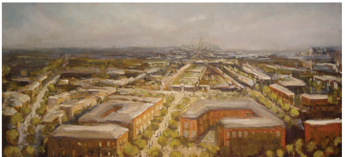
Promenade urbaine, Paris, Oil on canvas, 70 x 150 cm