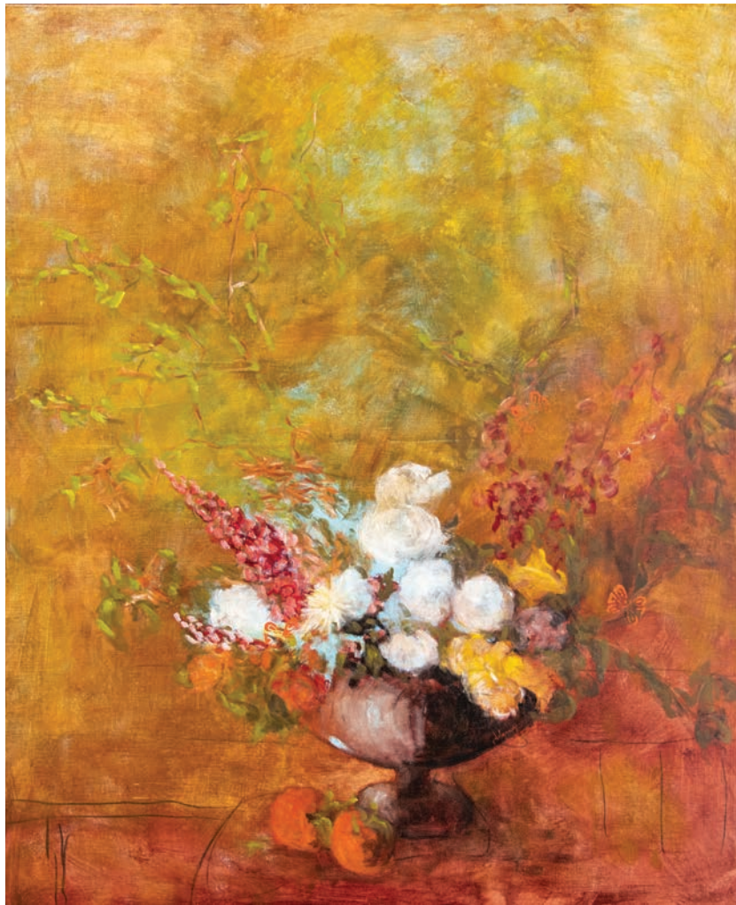
Les Fleurs du Bien n°21, Oil on canvas, 116 x 95 cm