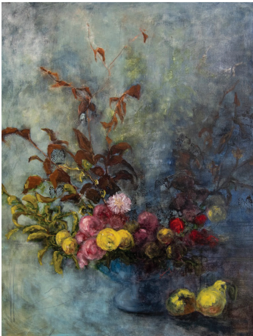
Les Fleurs du Bien n°19, Oil on canvas, 116 x 89 cm