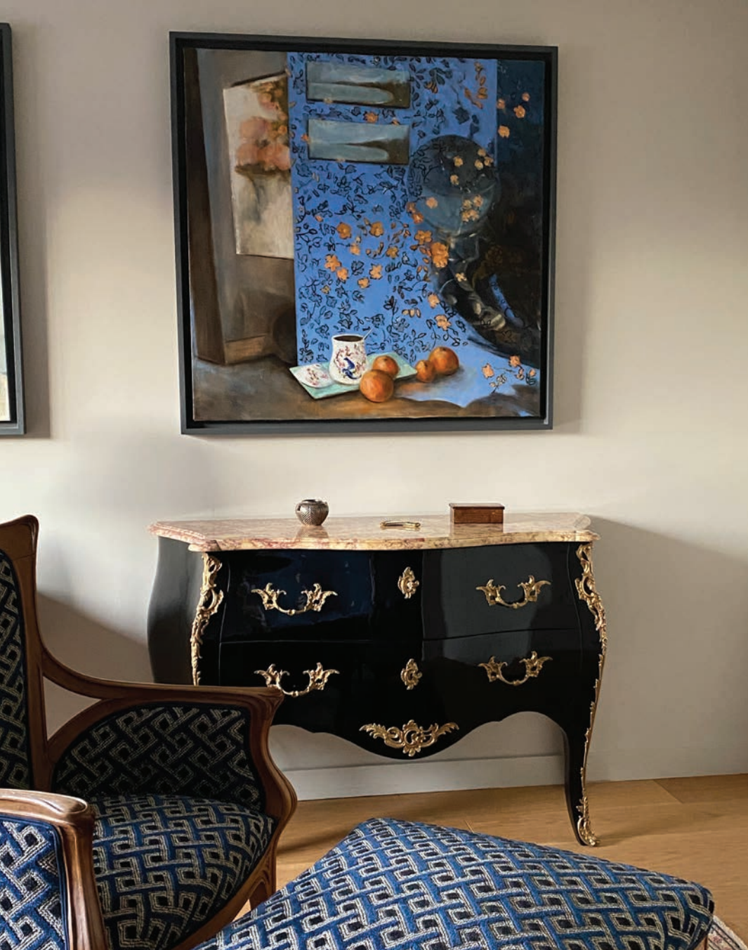
L'Envolée, Oil on canvas, 100 x 100 cm