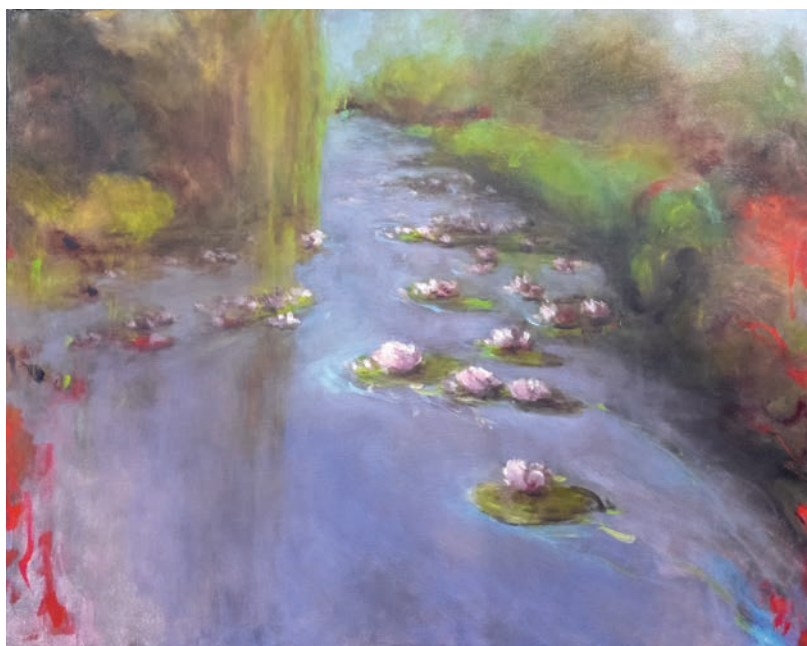
Les Nymphéas n°7, Oil on canvas, 125 x 160 cm