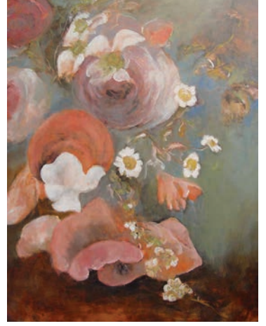
Danse avec les Marguerites, Oils on canvas, 146 x 114 cm each