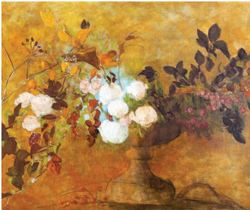
Les Fleurs du Bien n°20, Oil on canvas, 90 x 106,5 cm