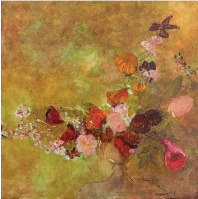
Les Fleurs du Bien n°22, Oil on canvas, 100 x 100 cm