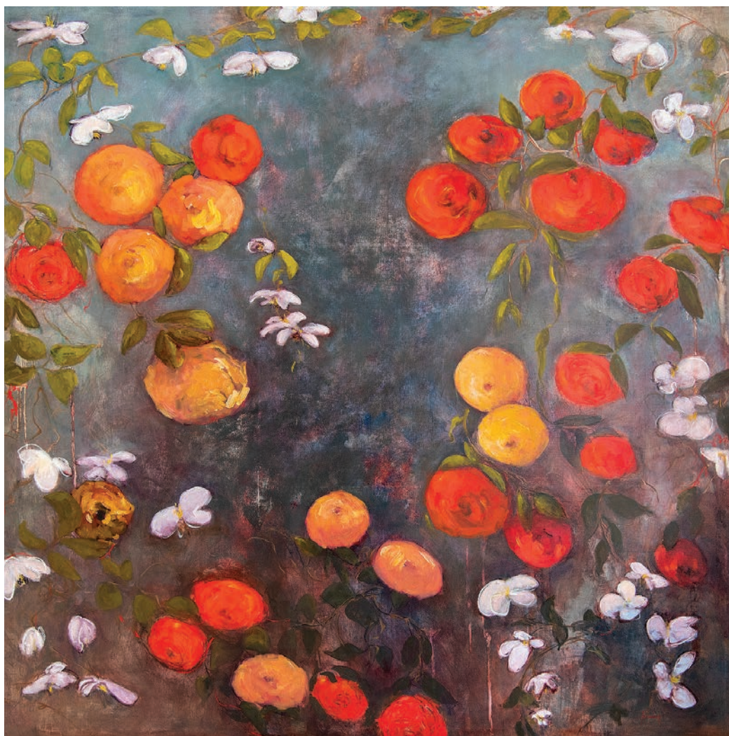
Les Fleurs du Bien n°26, Oil on canvas, 200 x 200 cm