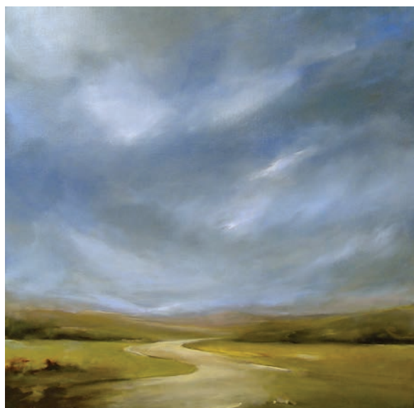
Paysages de composition, Oils on canvas, 100 x 100 cm each