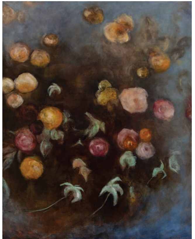
Les Fleurs du Bien n°24 & 25, Oils on canvas, 162 x 130 cm each