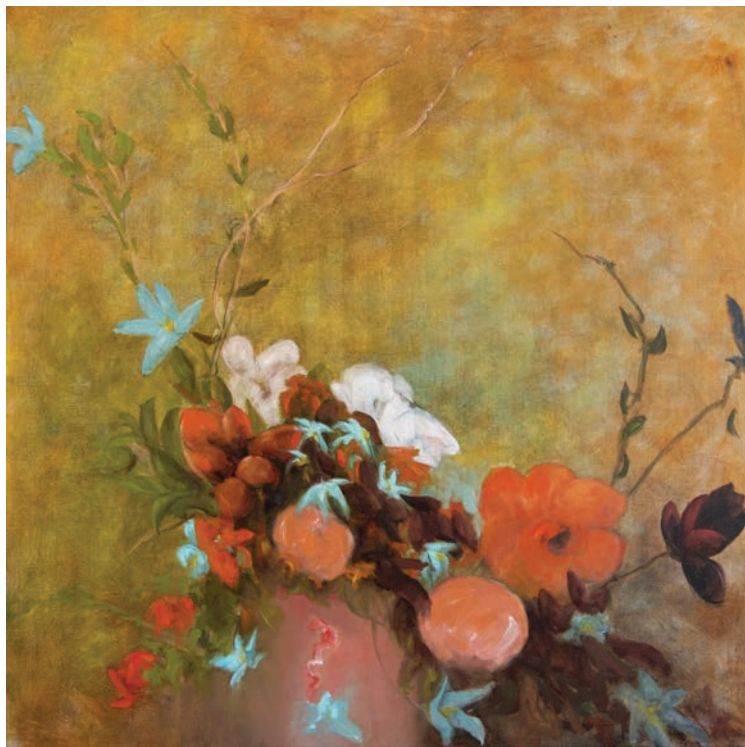
Les Fleurs du Bien n°23, Oil on canvas, 100 x 100 cm