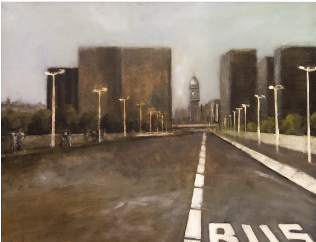
Gare de Lyon, Paris, Oil on canvas, 89 x 116 cm